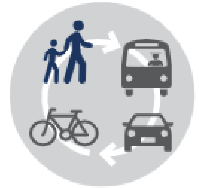
What do we have now?