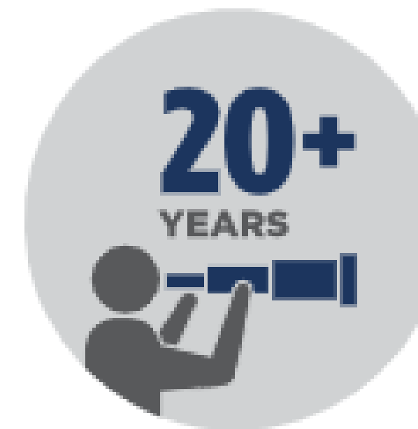
What will we need in the future?