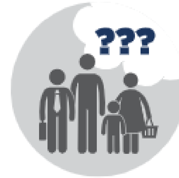
What do we want?