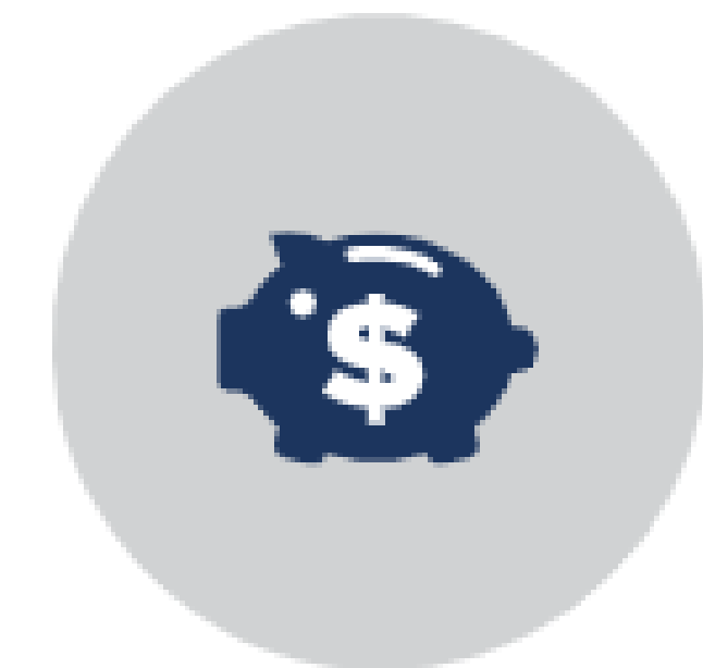
How will we fund our projects?